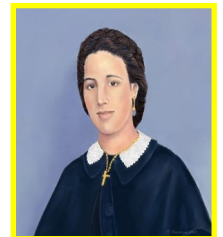
Ven. Henriette Delille 1812-1862

On the side of the church, there is a garden which honors all of the saints that influenced the Evangelization of New Orleans.