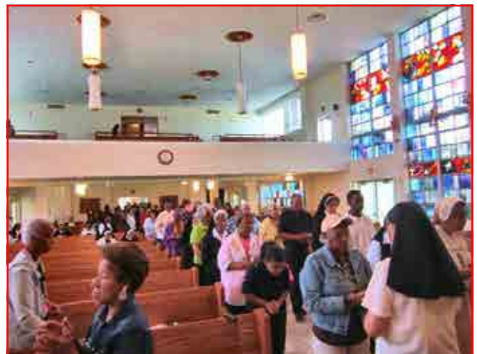
The Year of "Faith" and the "Family" was celebrated with a Mass and a picnic at the Motherhouse. Everyone enjoyed the Mass, their families, their friends, the delicious food, the fun and games.