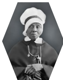
Servant of God M. Elizabeth Lange

She explained how saints are holy men or women who first serve God, abide by his rule, live in righteousness and love everyone. All four did that. They held steadfast to their faith amidst slavery and segregation.