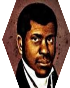
Venerable Pierre Toussaint