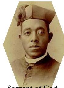
Servant of God Fr. Augustus Tolton