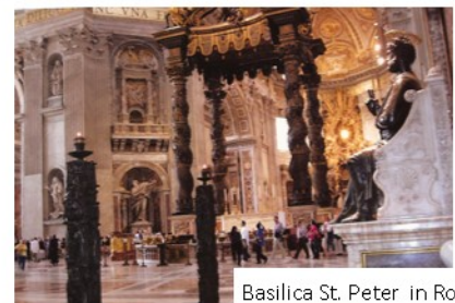
Basilica St. Peter in Rome.