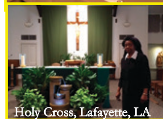
Holy Cross, Lafayette, LA