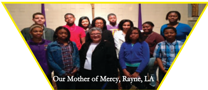
Our Mother of Mercy, Rayne, LA