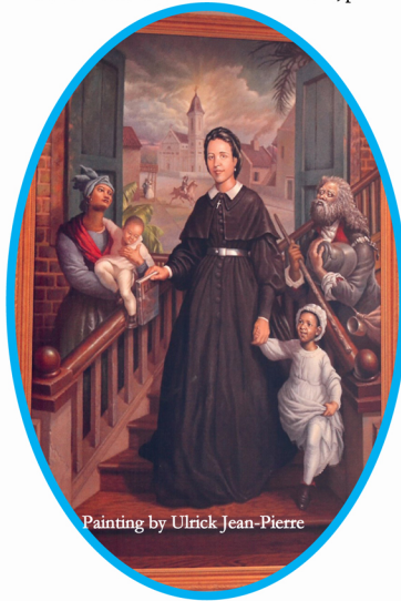
Painting by Ulrich Jean-Pierre