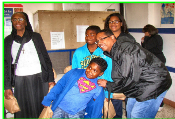
Gift bag givers